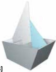
Ice blue [3]