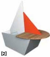
Flame red [2]