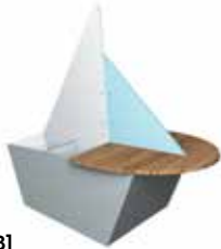
Ice blue [3]