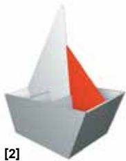
Flame red [2]