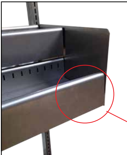
Double browser seen from the front