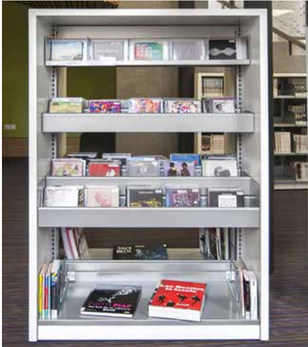
Single browser, H10 cm without tubes and double browser, H20 without tubes