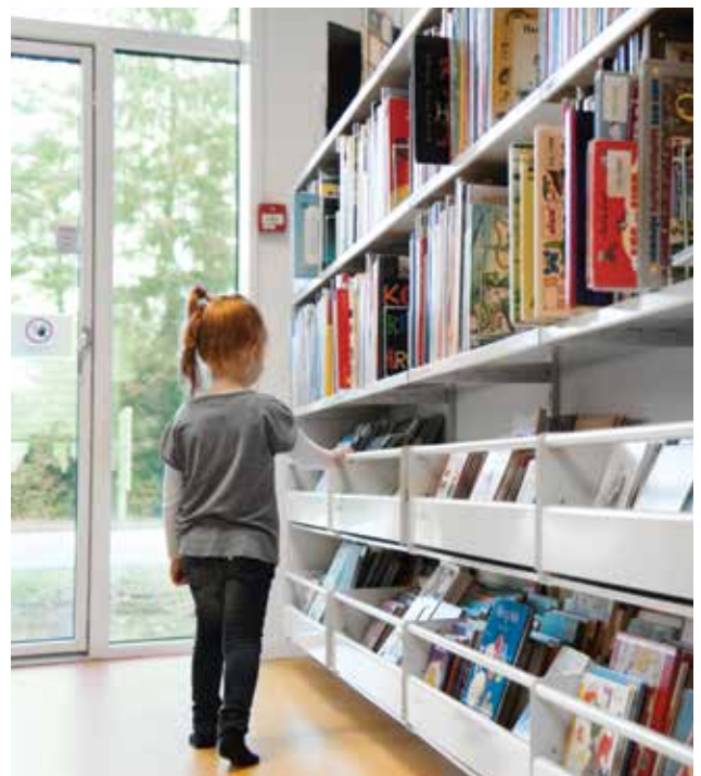
Single browser, H20 cm with tubes