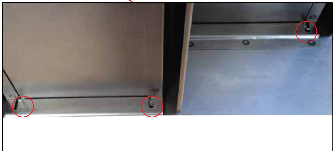
Double browser seen from the bottom