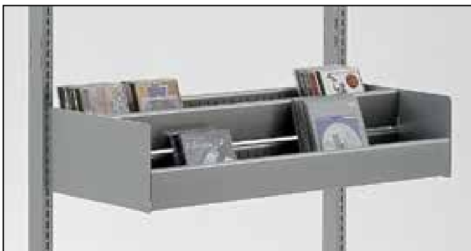
Double browser, H20 cm without tubes