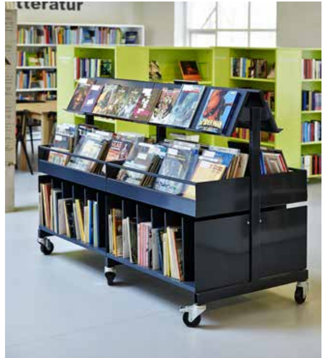
Single browser, H20 cm with tubes