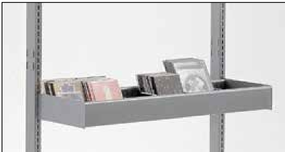
Single browser, H10 cm without tubes

You can install either a single or double browser in a shelving systems.