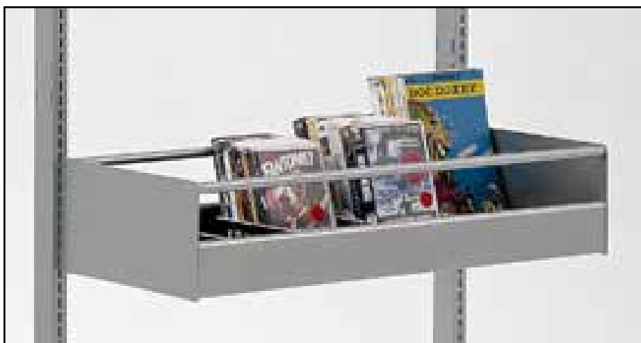
Single browser, H20 cm with tubes