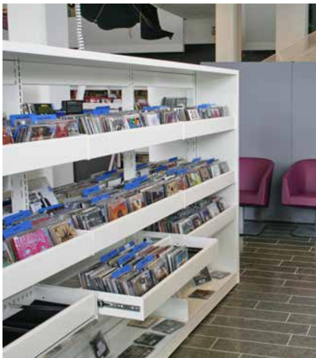
Single browser, H10 cm without tubes