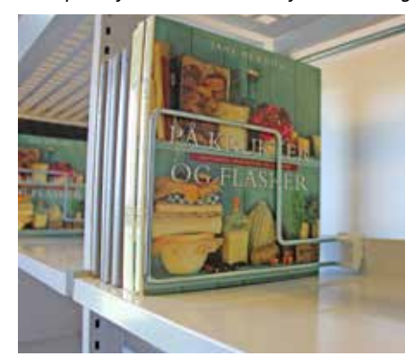
Standard model shelf depth 30 cm

Examples of various versions of the backedge book support: