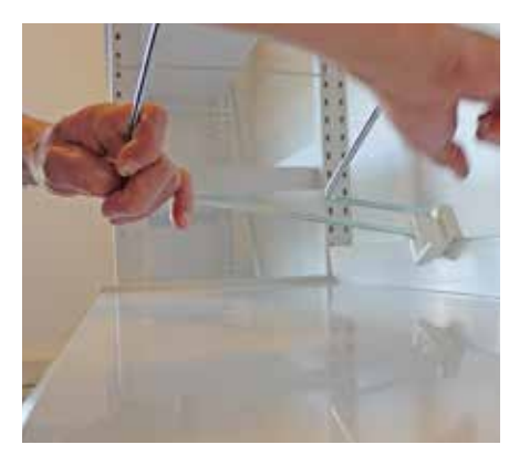
RIGHT (towards the plastic fitting)