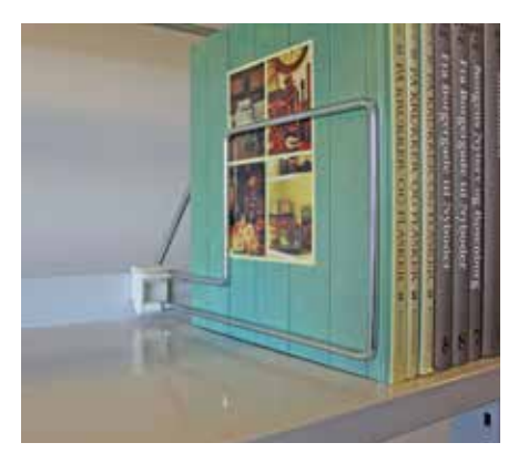
Laterally reversed model shelf depth 30 cm