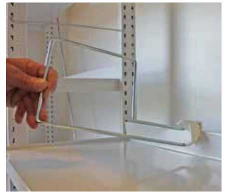
Place the plastic fitting on the back edge

The backedge book support is to be mounted on the backedge of the shelf by placing the plastic fitting on the backedge and pressing with the palm of your hand, until it is firmly fixed.