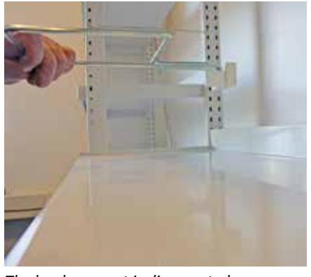
The book support is dismounted

Only dismount the book support when absolutely necessary, as the plastic fitting is exposed to wear and tear every time the book support is mounted and dismounted.