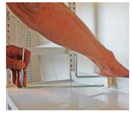
Press until firmly fixed (you will hear a loud click)