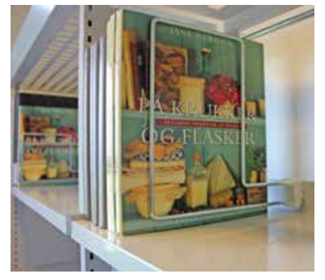
Standard high model