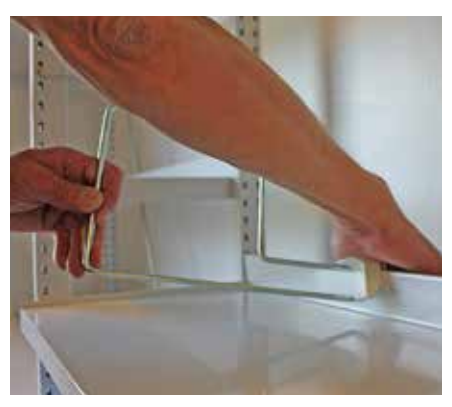
Press with the palm of your hand