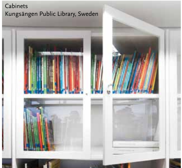
Cabinets Kungsängen Public Library, Sweden