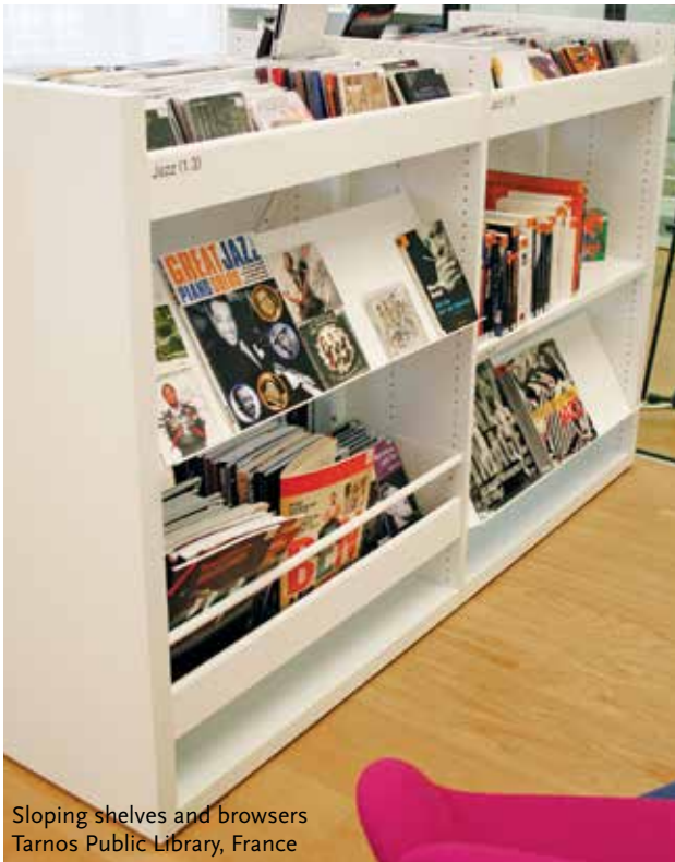
Sloping shelves and browsers Tarnos Public Library, France