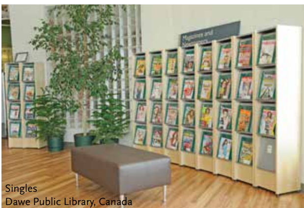
Singles Dawe Public Library, Canada