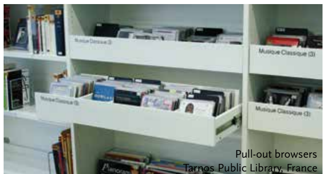
Pull-out browsers Tarnos Public Library, France