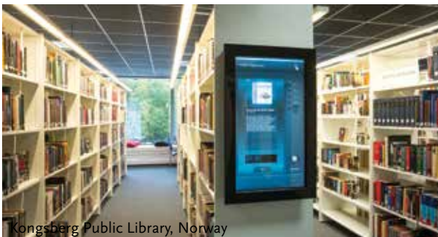
Kongsberg Public Library, Norway