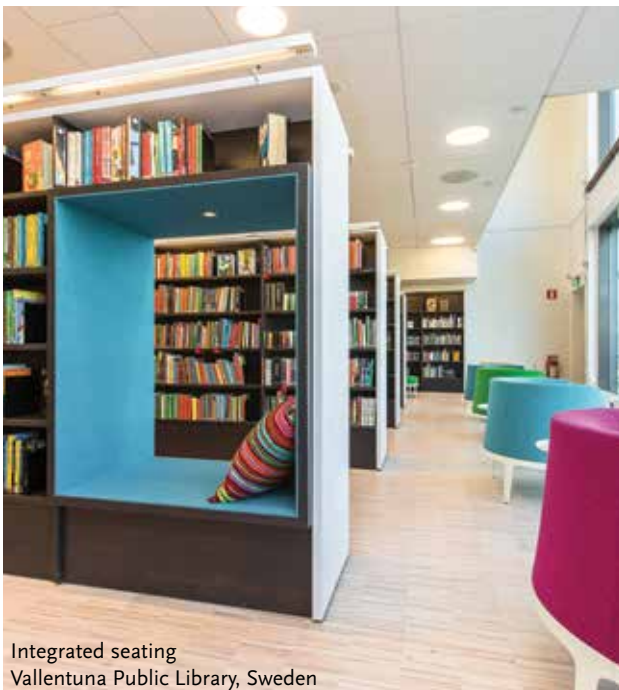
Integrated seating Vallentuna Public Library, Sweden

With our library design we want to ensure optimal user experiences. We do this based on a standard range of high quality products and a constant focus on developing additional individual solutions, so that we can meet the changing library needs.