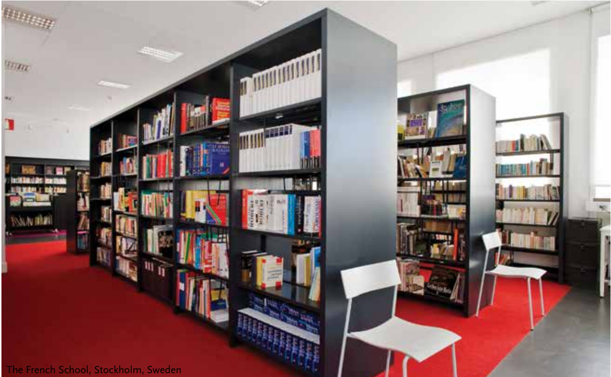
The French School, Stockholm, Sweden