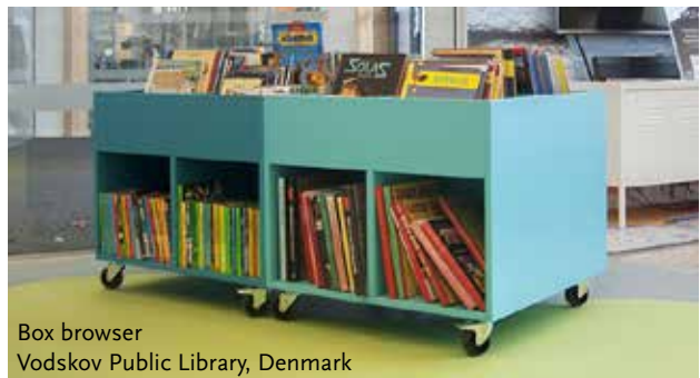
Box browser Vodskov Public Library, Denmark