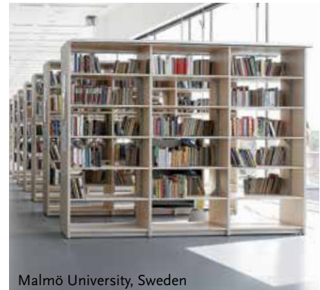
Malmö University, Sweden