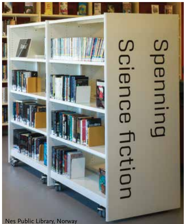
Nes Public Library, Norway