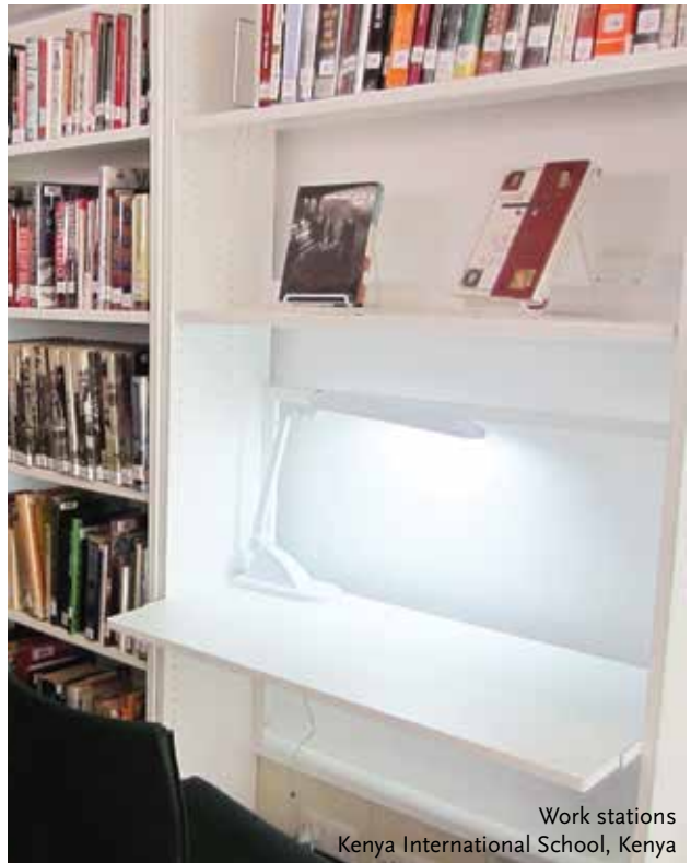
Work stations Kenya International School, Kenya