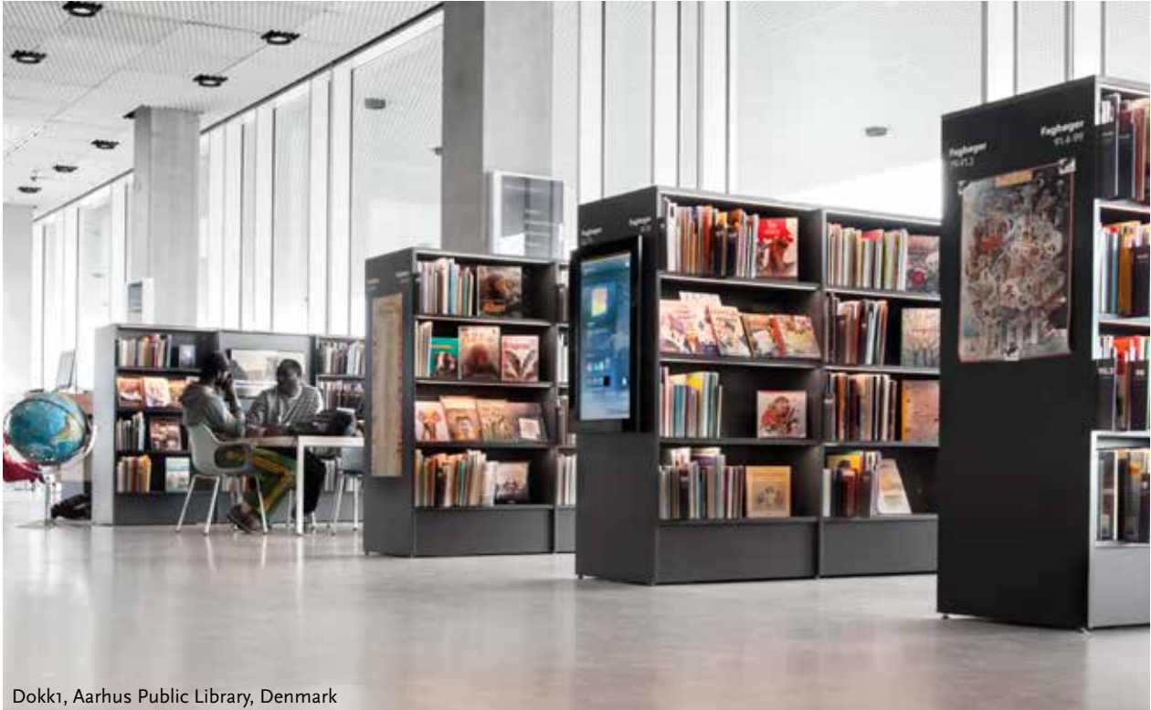
Dokki, Aarhus Public Library, Denmark