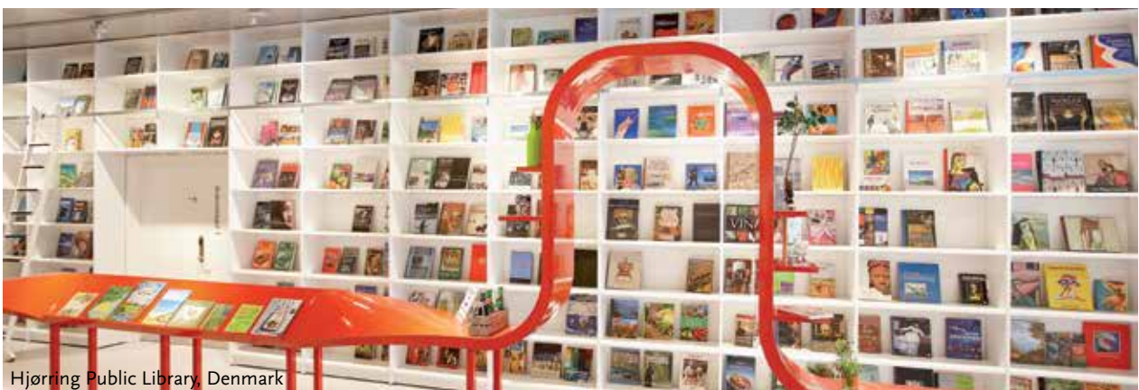
Hjørring Public Library, Denmark