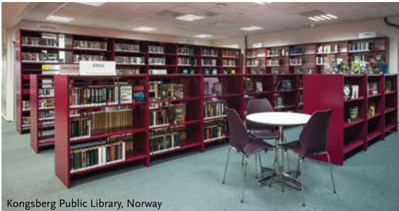
Kongsberg Public Library, Norway

Here are examples of projects with Slimline shelving system. Visit www.wearelibrarypeople.com for more photos and inspiration.