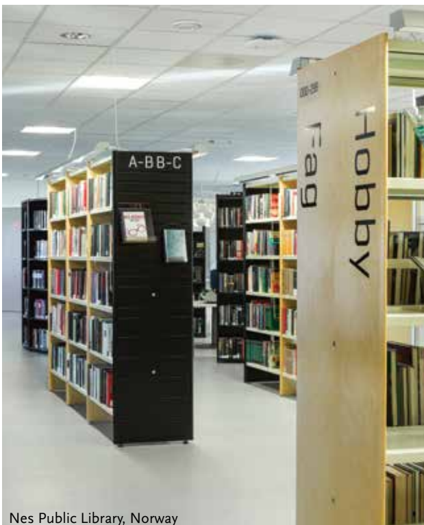
Nes Public Library, Norway

Here are examples of projects with Softline shelving system. Visit www.wearibrarypeople.com for more photos and inspiration.