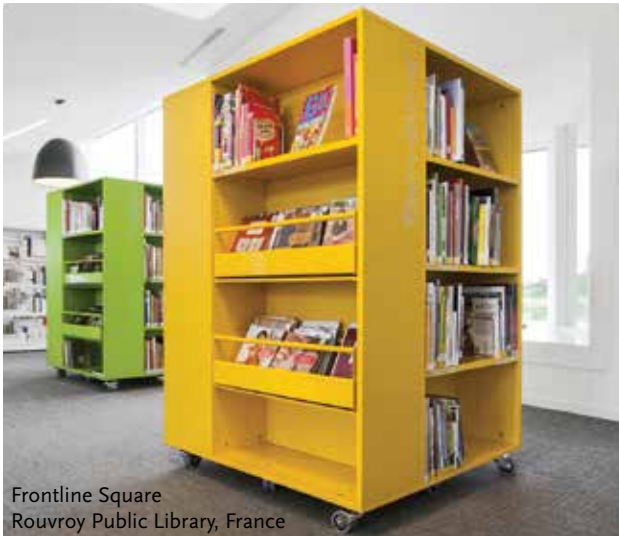
Frontline Square Rouvroy Public Library, France