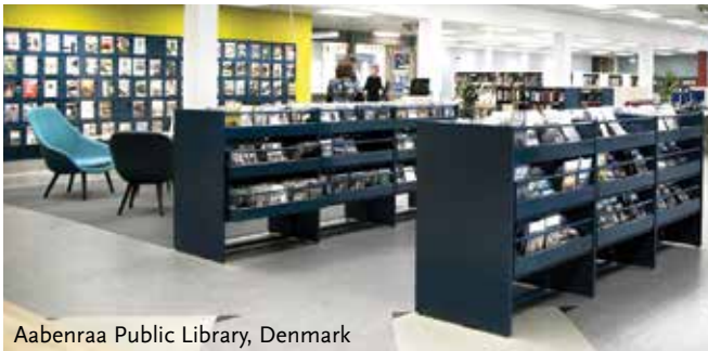
Aabenraa Public Library, Denmark

Here are examples of projects with Frontline shelving system. Visit www.wearelibrarypeople.com for more photos and inspiration.