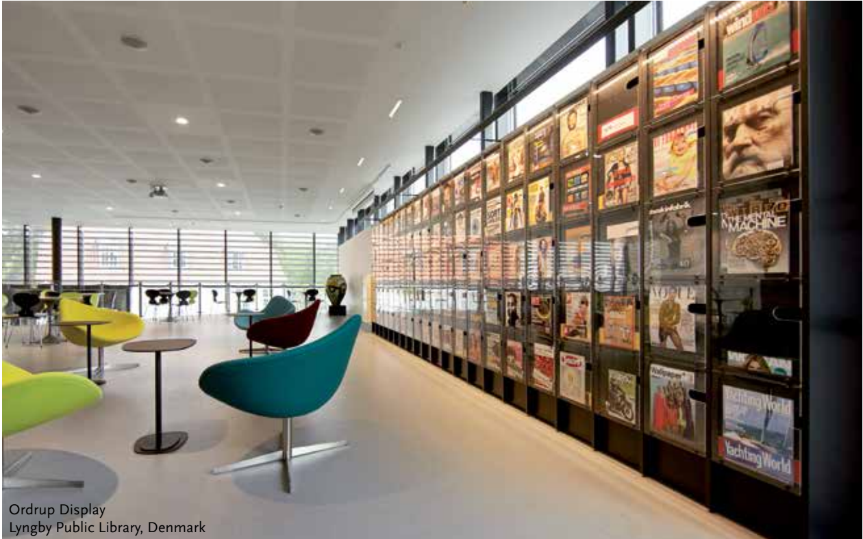
Ordrup Display Lyngby Public Library, Denmark