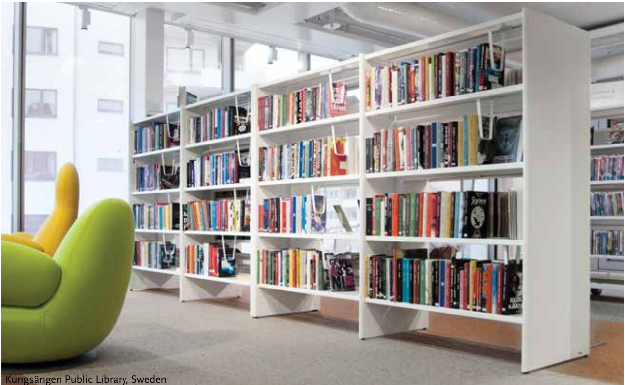
Kungsängen Public Library, Sweden