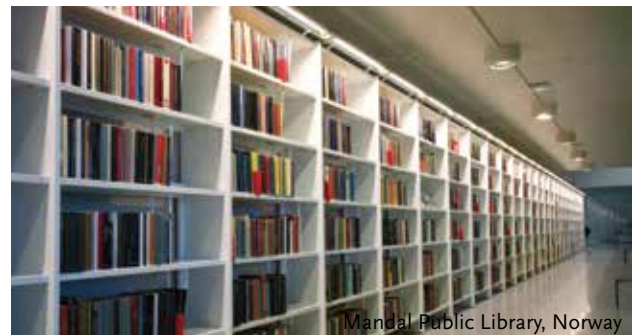
Mandal Public Library, Norway