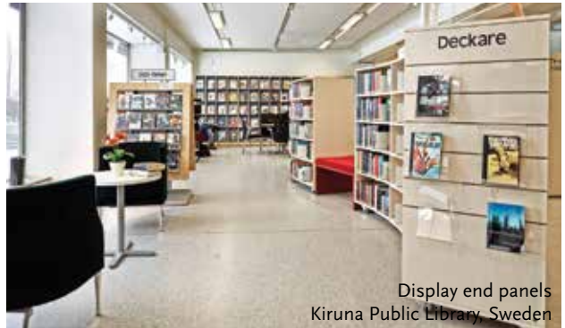
Display end panels Kiruna Public Library, Sweden