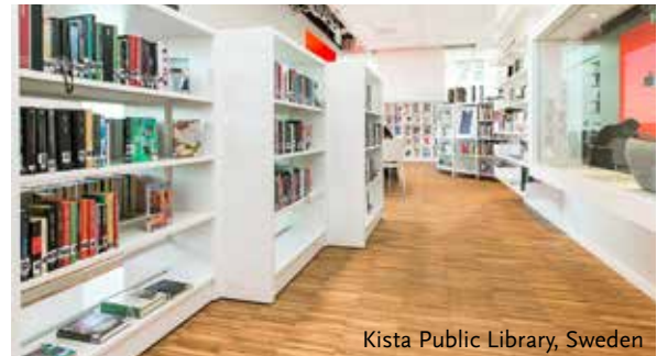
Kista Public Library, Sweden