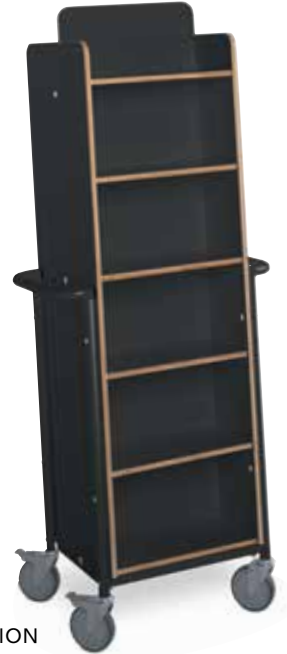
XL PLUS EXHIBITION

Functional, single-sided trolley with three fixed tilted shelves. Generous shelf depth and clearance between shelves. Capacity approx. 100 standard volumes. Size W1010 x D430 x H 1090 mm.