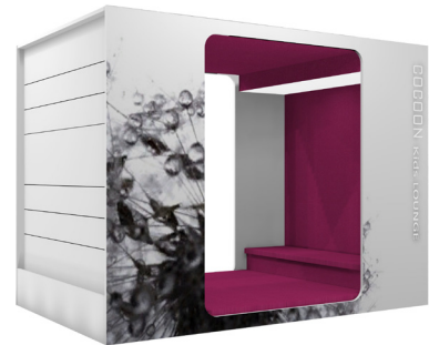
Cocoon Kids-Lounge XL