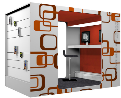
Cocoon Computer-Lounge XL