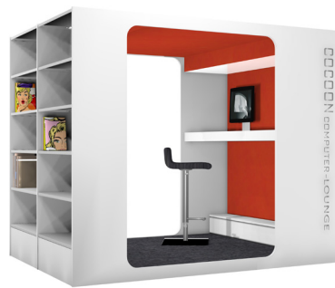
Cocoon Computer-Lounge L

Depending on choice of model, you can use the exterior surfaces for display on the high gloss display panel or you can install shelves, browsers and other functions from the Ratio shelving system.