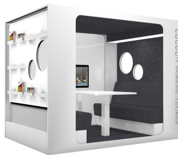
Cocoon Working-Lounge Exclusive

Create a zone for students and work groups with the Cocoon Working-Lounge.