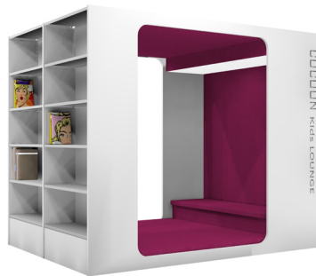
Cocoon Kids-Lounge L

Two models are available - L and XL - depending on if seating is required in both sides of the Lounge. Add graphics to the sides of the Lounge to create just the right atmosphere.