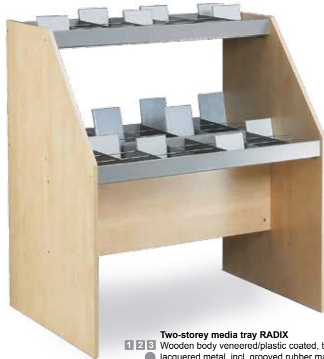
Two-storey media tray RADIX 1 2 3 Wooden body veneered/plastic coated, tray and dividers lacquered metal, incl. grooved rubber mat, threading bars and 18 dividers for approx. 630 CDs, shelf height 80 mm W 1128 mm, D 760 mm, H 1280 mm

An exciting colour and material combination is created by the metal tub and the wooden sides and give the user the option of leafing through the media with simultaneous front presentation. Variable management through mobile dividers, can also be used for videos and DVDs. Additional threading bars will hold the media even if the rows are not completely filled. Basic and add-on units allow an optimum combination of various media trays.