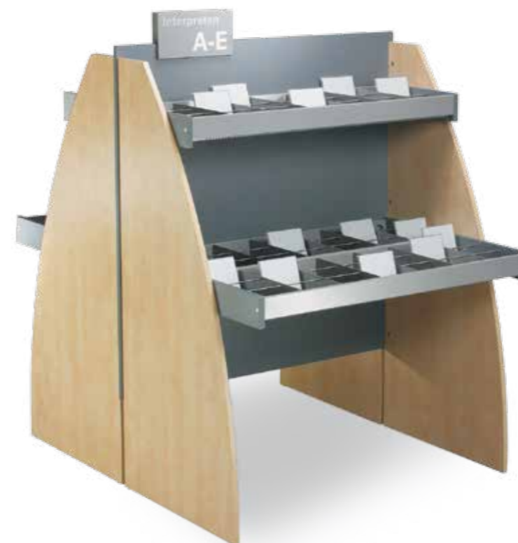
Put-on sign Lacquered metal, ● W 300 mm, D 40 mm, H 150 mm 2 put-on signs are required for double-sided lettering. SchulzLetteringService upon request